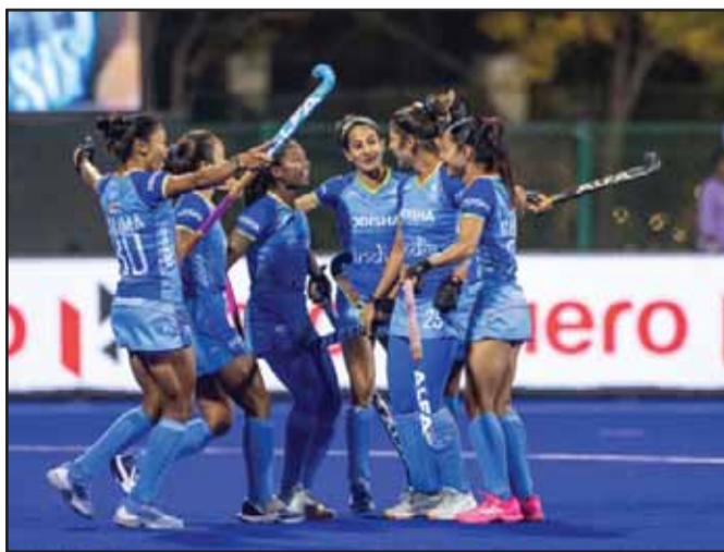
India's roadmap for the 2026 (Belgium/Netherlands) and this year's Asian Games. The series

New Delhi, 7/4 (H.S.): India's senior women's hockey team heads to Argentina this month for a four-match series from April 13-17 at CeNARD in Buenos Aires. The series pits India against the formidable South American hosts on their home turf, promising thrilling encounters on April 13, 14, 16, and 17, starting at 11:00 AM local time (6:30 PM IST). Recent clashes between the teams have been fiercely competitive, including a 2-2 draw in last June's FIH Pro League 2024-25 decided by shootout. This tour offers crucial match practice against top-tier opposition, aligning with Hockey