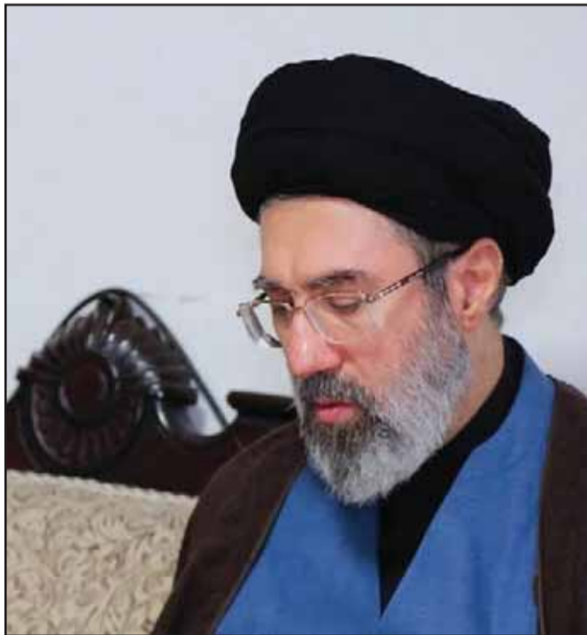
Khamenei. Iran's Supreme National Security Council reinforced Khamenei's position, stating that the truce does not

Tehran, 8/4 (H.S.): Iran's newly ascended Supreme Leader Mojtaba Khamenei has directed all military branches to halt fire under a fragile two-week ceasefire with the United States, while issuing a stark warning that the conflict remains far from resolved. In a statement broadcast on state-run Islamic Republic of Iran Broadcasting (IRIB), Khamenei emphasized strict adherence to his orders, declaring, "This is not the end of the war but all military branches should follow the Supreme Leader's order and cease their fire." This comes after U.S. President Donald Trump announced a temporary pause in strikes, contingent on Iran's agreement to reopen the Strait of Hormuz, following 39 days of intense hostilities that began with a U.S.-Israeli joint operation on February 28, which claimed the life of Khamenei's father, Ayatollah Ali