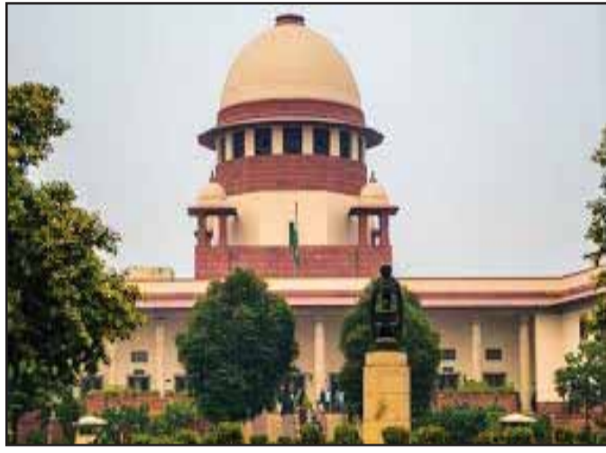
within three weeks. The Supreme Court has clarified that

New Delhi, 15/4 (H.S.): Congress leader Pawan Kheda has suffered a setback from the Supreme Court. The Supreme Court has stayed the one-week transit anticipatory bail granted to Pawan Kheda by the Telangana High Court. The Assam government had approached the Supreme Court against this Telangana High Court order, arguing that the Telangana High Court did not have territorial jurisdiction to hear this case. On the Assam government's petition, the Supreme Court has issued a notice to Pawan Kheda. The Court has directed Pawan Kheda to file his reply