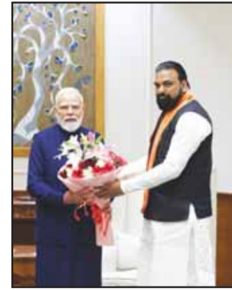
conviction that under his leadership the state will attain new heights by fulfilling the

New Delhi, 15/4 (H.S.): Prime Minister Narendra Modi has congratulated Samrat Choudhary on Wednesday for taking the oath as Chief Minister of Bihar and has expressed confidence that the state will achieve comprehensive development under his leadership. In a message posted on the social-media platform X, the Prime Minister said that Samrat Choudhary's energy, dedication to public service, and grassroots experience will play a significant role in Bihar's development. He expressed the