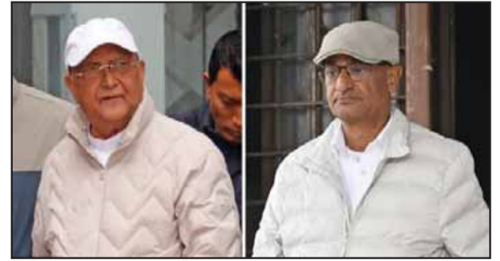
prosecutor's office, Oli's at the hospital where he remains admitted for health issues since arrest day. Key Investigative Directives Authorities must annex post-mortem reports for all deaths during the September 8, 2025, Gen Z movement clashes. Eyewitnesses to that day's