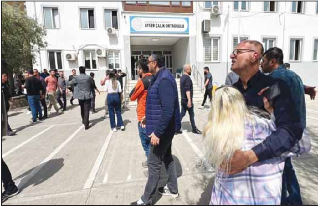
This horror follows Tuesday's attack in Sanliurfa's Siverek district, where an 18-year-old ex-student wounded 16 at Ahmet Koyuncu Vocational High School before suicide. Such school shootings, once exceedingly rare