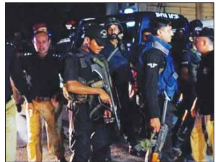
Islamabad, 16 /4 (H.S.):Security forces in Pakistan's Khyber Pakhtunkhwa province are locked in an intense gunbattle with militants, leaving two terrorists dead and at least one police officer martyred, while several others have been wounded. The operation, launched late at night in the Baghoto Top Serki and Chambar Gul areas, marks the latest chapter in Pakistan's ongoing counterterrorism campaign in its volatile northwestern belt. According to local police reports, security teams cordoned off the two mountainous zones late Wednesday and launched a major raid against a group of suspected terrorists. A senior police officer in Kohat confirmed that the operation

has been underway for several hours and will continue until every trapped militant is neutralised. "The operation is now in a decisive phase," the Kohat Superintendent of Police told reporters, underscoring that no terrorist would be allowed to escape the encircled area. Officials say two militants were killed in the initial exchange of fire, while at least one police officer lost his life in the operation. Several other police personnel sustained injuries but are reported to be stable. The high-alert security environment in Khyber Pakhtunkhwa has prompted authorities to intensify search and clearance operations across the region, as part of a broader drive to disrupt militant networks and prevent further attacks on civilian and security targets.