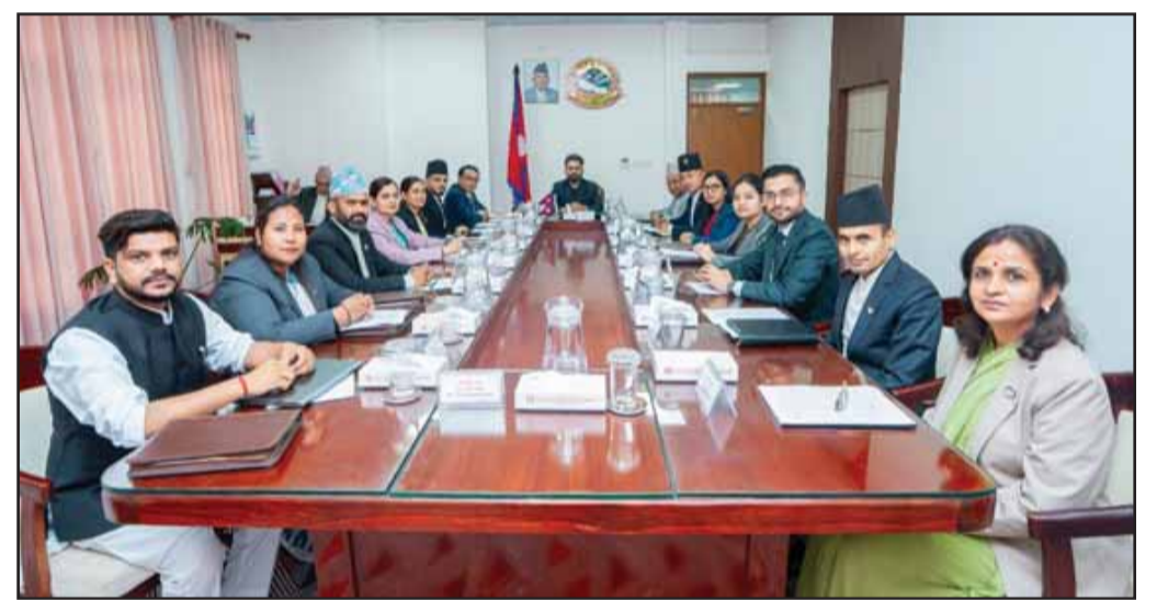
Kathmandu, 16 /4 (H.S.):The Government of Nepal is poised to enact more than 100 new laws while amending existing legislation, with subject identification now complete across key sectors. Government spokesperson and Education Minister Sasmit Pokhrel revealed that 103 topics for fresh

legislation and targeted amendments have been finalized. All 22 ministries, in coordination with the Prime Minister's and Cabinet offices, are prioritizing these initiatives to expedite drafting and implementation. The Ministry of Law, Justice, and Parliamentary Affairs is rigorously reviewing compliance