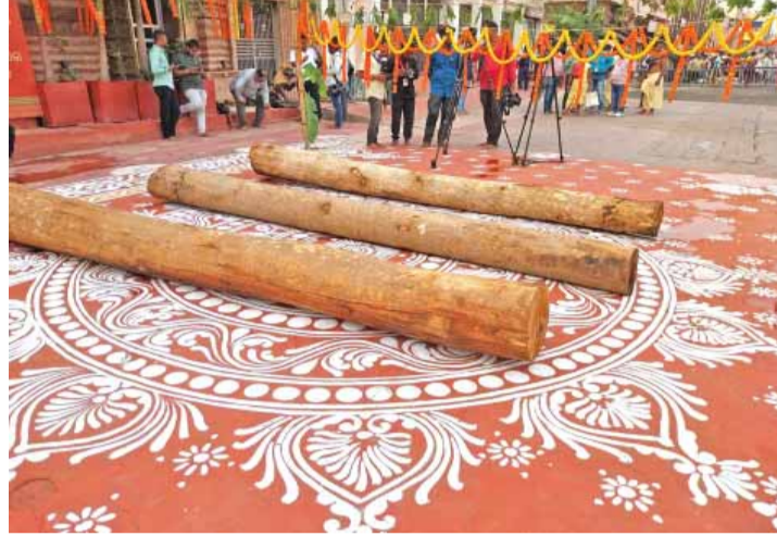
“Habisa Anna” (a simple, sacred diet), and work with full devotion at the Rathakhala (chariot construction yard). All necessary

From Akshaya Tritiya until Netrotsava, the servitors engaged in chariot construction will observe strict discipline, consuming only