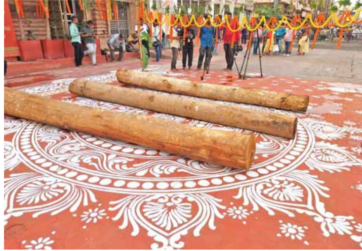
“Habisa Anna” (a simple, sacred diet), and work with full devotion at the Rathakhala (chariot construction yard). All necessary

From Akshaya Tritiya until Netrotsava, the servitors engaged in chariot construction will observe strict discipline, consuming only