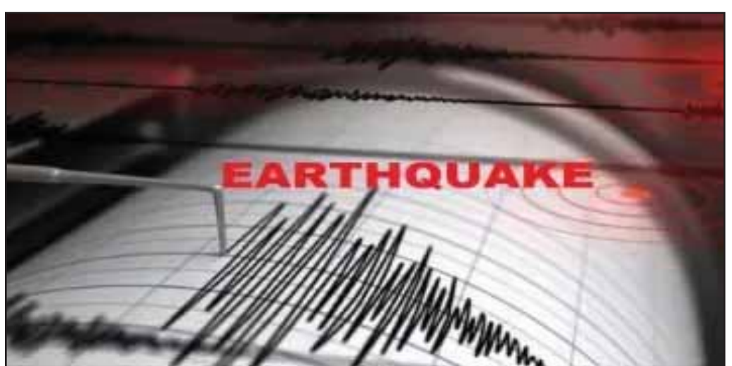
reported that the quake struck at a depth of 10 km. The Japanese weather agency issued tsunami warnings for the Pacific coasts of Hokkaido,

to the Japan Meteorological Agency, state media Kyodo cited. 'Notable quake, preliminary info: M 7.4 - 100 km ENE of Miyako, Japan,' the USGS said.