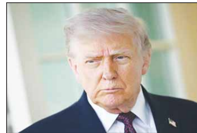
describing it as reckless largesse that fueled Iranian aggression. Trump asserted that his administration's emerging pact would eliminate such risks, ensuring no nuclear proliferation threatens Israel, the Middle East,

Washington, 21/4(H.S.): US President Donald Trump has sharply intensified his rhetoric against the Obama-era Iran nuclear deal, promising a forthcoming agreement that surpasses it in safeguarding global security.