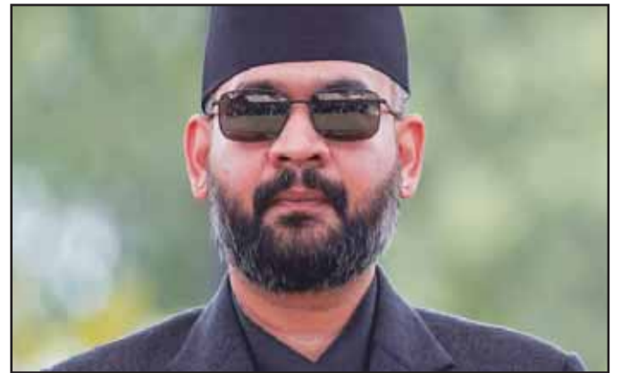
compulsory for any public disclosure. On March 31, Shah further mandated ministers and senior officials submit daily work reports, with under-secretaries designated as focal points for compliance.

Kathmandu, 21/4 (H.S.): Prime Minister Balendra Shah's office (PMO) has issued a binding directive to all ministries: no policy decisions or official statements may be publicly disclosed without prior PMO approval.