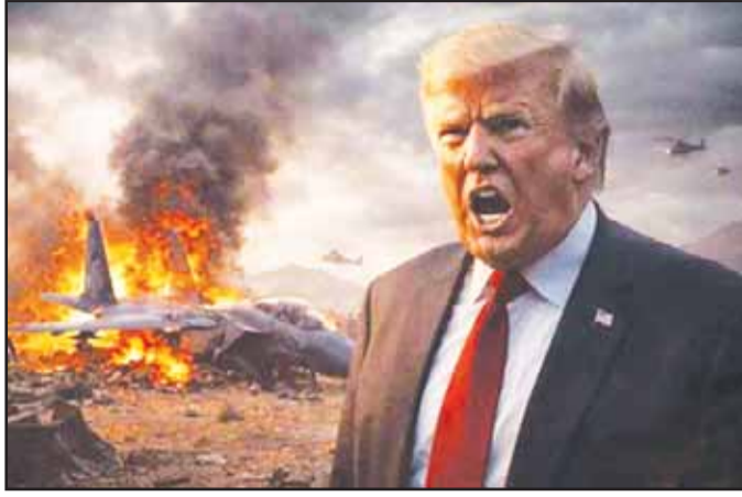
'very difficult.' He anticipates Tehran rebuilding sans nuclear arms post-deal. The US team, including VP JD Vance, Jared Kushner, and envoy Steve Witkoff, heads to Islamabad. Trump justified military blockade, vowing sustained

Tehran/Washington/Islamabad, 21/4(H.S.): The US-Iran ceasefire, originally set to expire today, has been extended for two additional days, President Donald Trump announced personally.