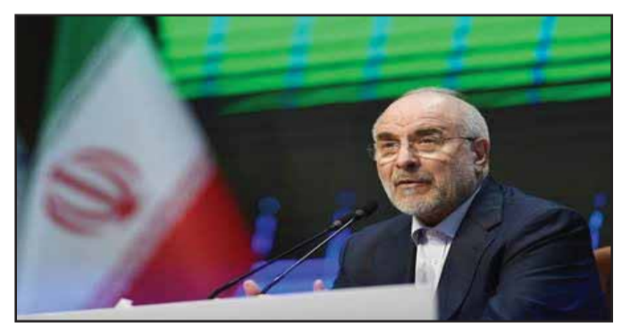
preparing to show new cards on the battlefield. His words arrive just days before the truce—brokered amid spiraling tensions in the Middle East—nears its expiration, injecting fresh uncertainty into an already volatile diplomatic landscape.

Tehran, 21/4(H.S.): In a stark escalation of rhetoric, Iran's parliament speaker Mohammad Bagher Ghalibaf has issued a veiled threat to the United States and Israel, vowing to unveil 'new cards' on the battlefield should the fragile two-week ceasefire collapse.