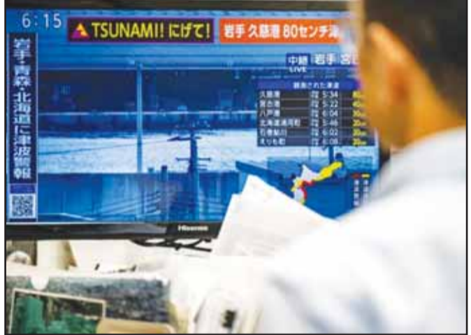
Takaichi urged: 'Residents in warned areas, move to high, safe ground without delay.' Her office scrambles to assess hidden injuries and structural harm. Japan, home to 125 million atop four colliding tectonic plates along the Pacific Ring of Fire's western edge, records ~1,500 quakes yearly—18% of global total.

Tokyo, 21/4 April (H.S.): The Japan Meteorological Agency has sounded an urgent alert for a potential earthquake of 8.0 magnitude or greater, issued just hours after a powerful 7.7-magnitude tremor struck Monday evening.