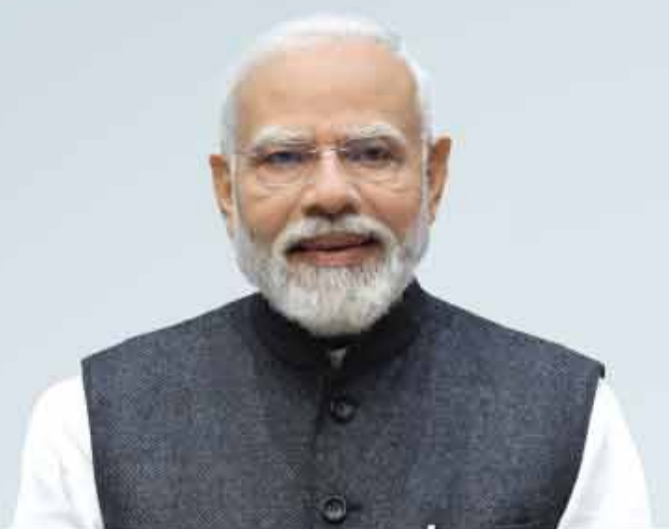
SHRI NARENDRA MODI