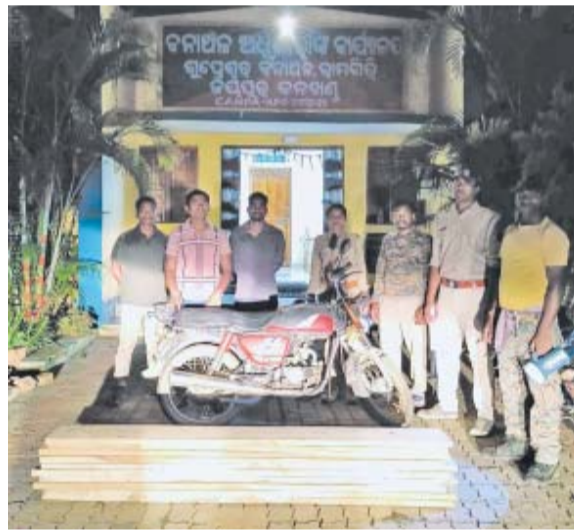
attempt. During the patrol Environment Department, the smugglers abandoned

Boipariguda (Bikrant Kumar Beborla): Timber smugglers were attempting to transport wood under the cover of darkness when a raid in the Ramagiri forest range resulted in the seizure of wood worth lakhs of rupees; the incident has sparked speculation among locals about whether the timber traders are finally facing a reckoning. The Forest Department conducted the raid after staff from the Pansput section of the Ramagiri range, who were out on night patrol, intercepted the smuggling