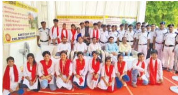
Today, Safe Tomorrow."

As part of the observance of International Level Crossing Awareness Day (ILCAD) 2026, Khurda Road Division conducted a Special Safety Awareness Campaign from 03.06.2026 to 09.06.2026 at various level crossing gates under its jurisdiction, including LC Nos. KP-9, KP-11, KP-14, KP-27, 202, 255, 263, 118, 119, 120, 142, 147, 289, 292, 185 and 219. The campaign culminated with the observance of International Level Crossing Awareness Day on 09.06.2026. International Level Crossing Awareness Day (ILCAD) is a global initiative aimed at enhancing public awareness regarding safety at railway level crossings. The theme for ILCAD 2026 is "Alert