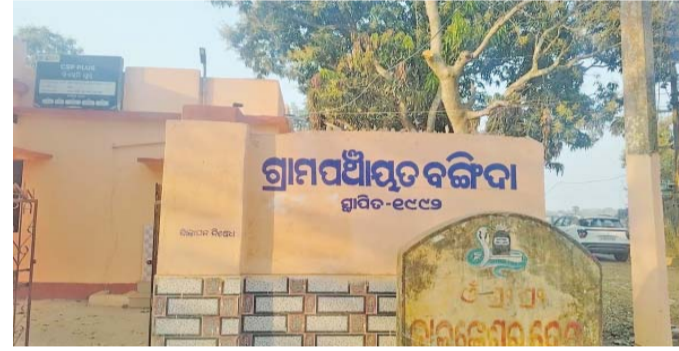
address to the Collector khordha today during the joint public hearing camp in Bangida GP. The villagers have appealed to the

time. After many complaints, the engineer of RWSS recently declared the tube well inoperative. No departmental step has been taken to install a new tube well for the residents of the locality who depend on that tube well. The drinking water supplied by the department through pipes line for only 15 to 20 minutes, that cannot meet the demand of the local residents and keeping in mind the problem of drinking water residents of Ward No.-7 submitted a grievance petition