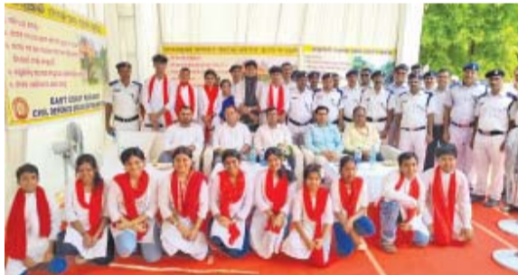
Today, Safe Tomorrow."

As part of the observance of International Level Crossing Awareness Day (ILCAD) 2026, Khurda Road Division conducted a Special Safety Awareness Campaign from 03.06.2026 to 09.06.2026 at various level crossing gates under its jurisdiction, including LC Nos. KP-9, KP-11, KP-14, KP-27, 202, 255, 263, 118, 119, 120, 142, 147, 289, 292, 185 and 219. The campaign culminated with the observance of International Level Crossing Awareness Day on 09.06.2026. International Level Crossing Awareness Day (ILCAD) is a global initiative aimed at enhancing public awareness regarding safety at railway level crossings. The theme for ILCAD 2026 is "Alert