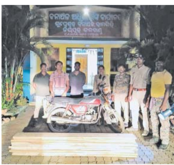
attempt. During the patrol Environment Department, the smugglers abandoned

Boipariguda (Bikrant Kumar Beborla): Timber smugglers were attempting to transport wood under the cover of darkness when a raid in the Ramagiri forest range resulted in the seizure of wood worth lakhs of rupees; the incident has sparked speculation among locals about whether the timber traders are finally facing a reckoning. The Forest Department conducted the raid after staff from the Pansput section of the Ramagiri range, who were out on night patrol, intercepted the smuggling