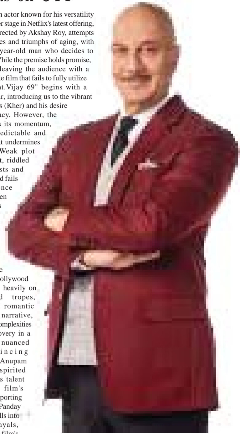
The direction lacks finesse, and the editing is jarring, contributing to a disjointed viewing experience. The film struggles to maintain a consistent tone, oscillating between lighthearted moments and heavy-handed melodrama. Missed opportunities: The film touches upon the challenges faced by older individuals in a society that often dictates how they should live their lives. However, it fails to delve deeper into these themes, opting for superficial portrayals instead of exploring the nuances of aging and societal expectations.