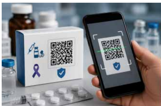
According to the government, the QR code will store key information that can be accessed through software

Manufacturers will be required to print or affix the QR code on the primary packaging label of the product. Where space constraints exist, the code may be placed on the secondary packaging label.