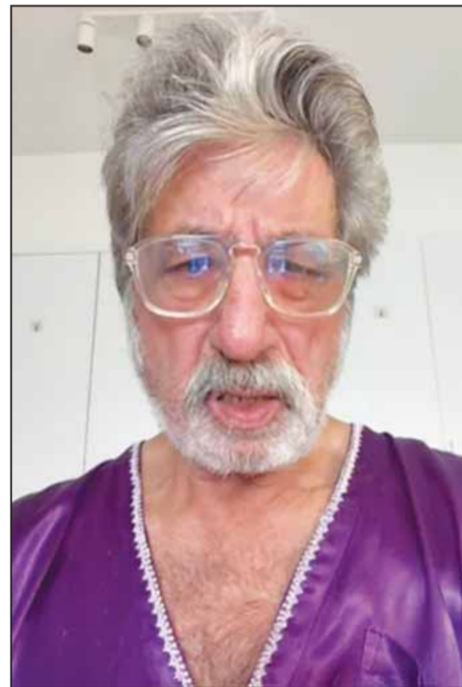
Kapoor, Rakul Preet Singh and Bhumi Pednekar in lead roles. Before that, he also appeared in Sandeep Reddy Vanga's Animal alongside Ranbir Kapoor, Anil Kapoor and Rashmika Mandanna

Veteran actor Shakti Kapoor has reacted strongly after fake reports about his death started circulating online. The actor called the rumours "completely fake" and said he is "healthy and happy." In a video message shared on his Instagram account, Shakti Kapoor called rumours "not good." The veteran actor said he plans to take legal action and file a cyber complaint against those spreading the false news. Addressing his fans and followers, Kapoor said, "Hello everyone, the news of my death is completely fake. I am healthy and happy. Please ignore it. I am going to cyber complain about it. But this is not good. That's not good." Shakti Kapoor is one of Bollywood's most popular character actors and is known for playing both comic and villainous roles. Over the years, he has appeared in more than 700 films and became especially famous during the 1980s and 1990s. Some of his well-known films include 'Raja Babu', 'Andaz Apna Apna', 'ChaalBaaz', 'Coolie No. 1', 'Judwaa', 'Satte Pe Satta' and 'Bol Radha Bol'. The actor was last seen in 'Mere Husband Ki Biwi', directed by Mudassar Aziz. The film starred Arjun