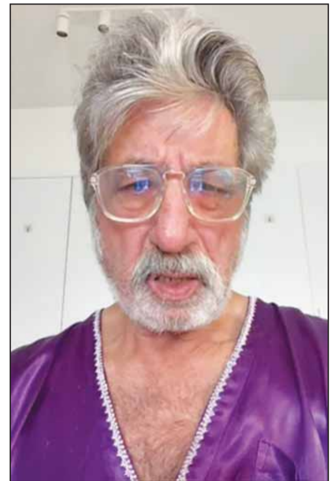
Kapoor, Rakul Preet Singh and Bhumi Pednekar in lead roles. Before that, he also appeared in

Shakti Kapoor is one of Bollywood's most popular character actors and is known for playing both comic and villainous roles. Over the years, he has appeared in more than 700 films and became especially famous during the 1980s and 1990s. Some of his well-known films include 'Raja Babu', 'Andaz Apna Apna', 'ChaalBaaz', 'Coolie No. 1', 'Judwaa', 'Satte Pe Satta' and 'Bol Radha Bol'. The actor was last seen in 'Mere Husband Ki Biwi', directed by Mudassar Aziz. The film starred Arjun